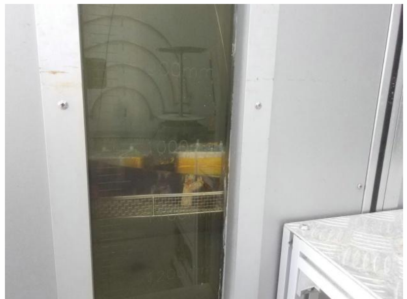
Test Set-up Photo